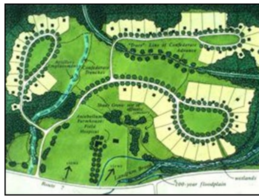
Traditional Subdivision Plat